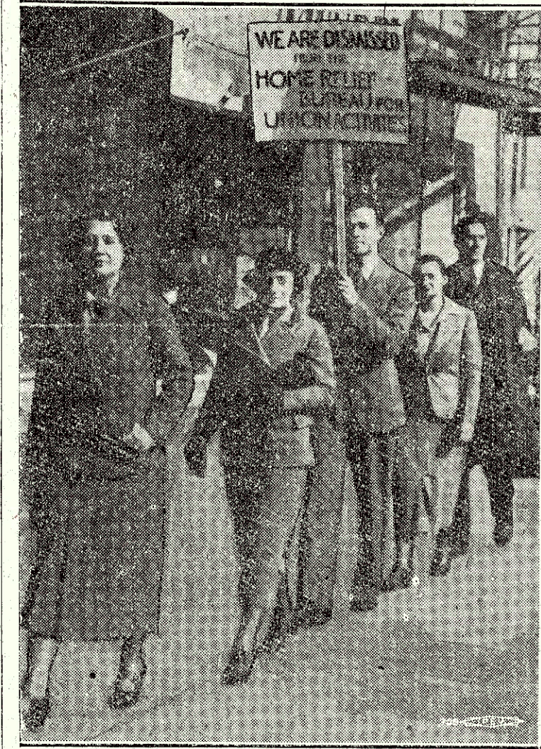
Things got reversed in New York City recently and action followed reaction. With relief appropriations cut and social service workers lopped off the payroll in "economy moves" these workers took to the picket line in an organized effort to win back their jobs and their livelihood.