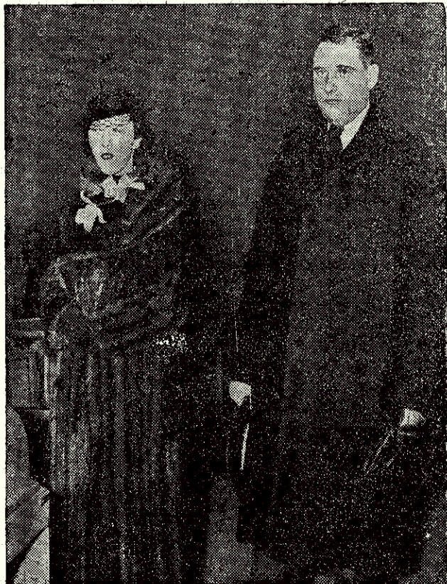
JOHN JACOB ASTOR III (no less) and his missus and her new mink coat, off to Europe. Johnny inherited millions in real estate, stocks and bonds, steamship lines and other trinkets, from a father who inherited them from his father who also inherited—right back to the semi-brigand who first robbed the workers, farmers, Indians, etc., to establish this more or less royal house. Johnny the III had a $25 a week job as shipping clerk, "starting from the ground up"—but he quit because he couldn't get a 30-hour week. Said it, "took up too much of my time."