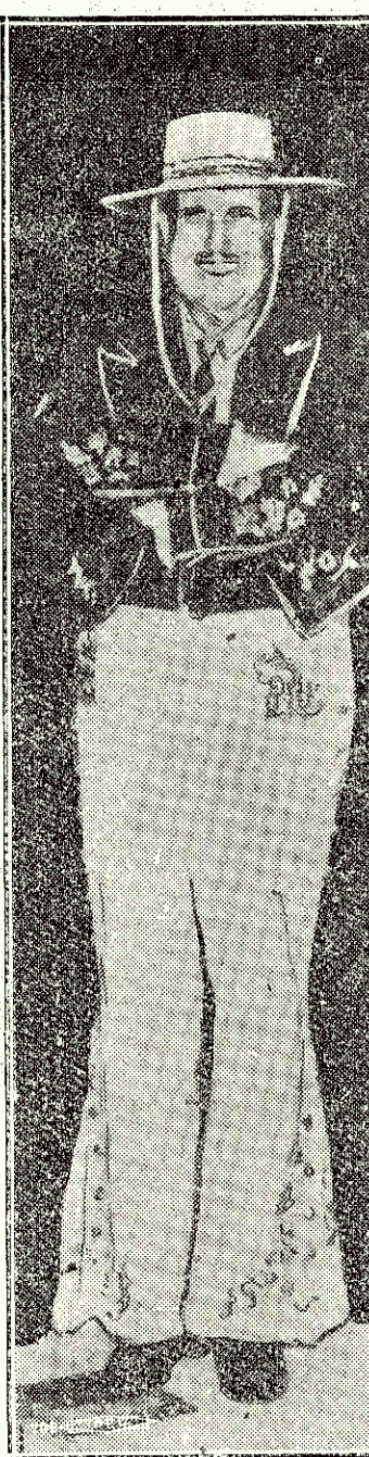
Willie Hearst dressed himself up as a Spanish bull fighter when he celebrated his 73rd birthday at his San Simeon estate. But he's no more popular in Spain, on whom he waged war in 1898, than he is at home where he is known to millions as "dirty Willie."