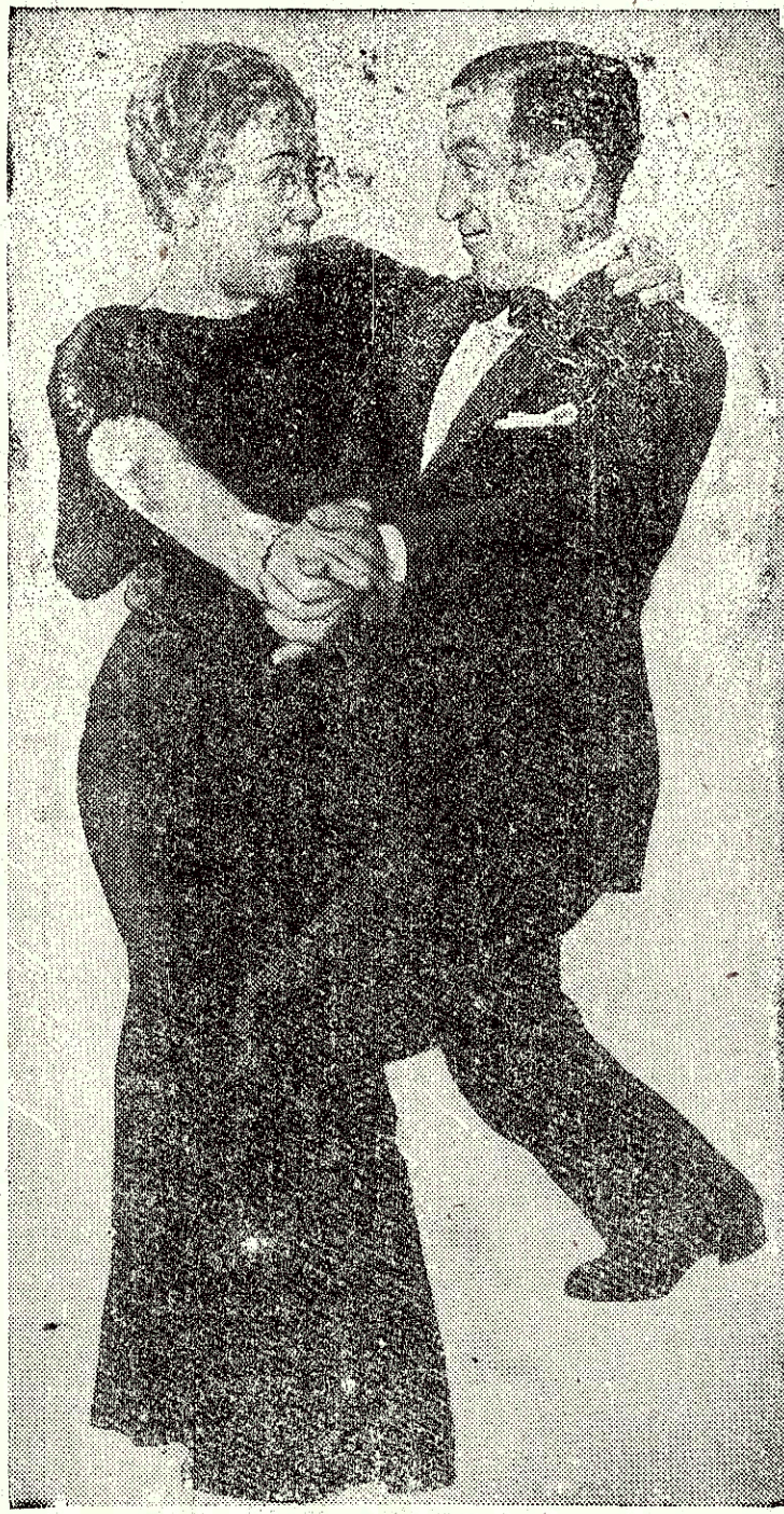
"COLLEN" is one of the recent films on our recommended list chiefly for the comedy of Hugh Herbert who plays the part of the "fatigued" millionaire. Above, he is depicting the "lighter" side of his millionaire existence in a bit of hey-de-ho with Louis Fazenda.