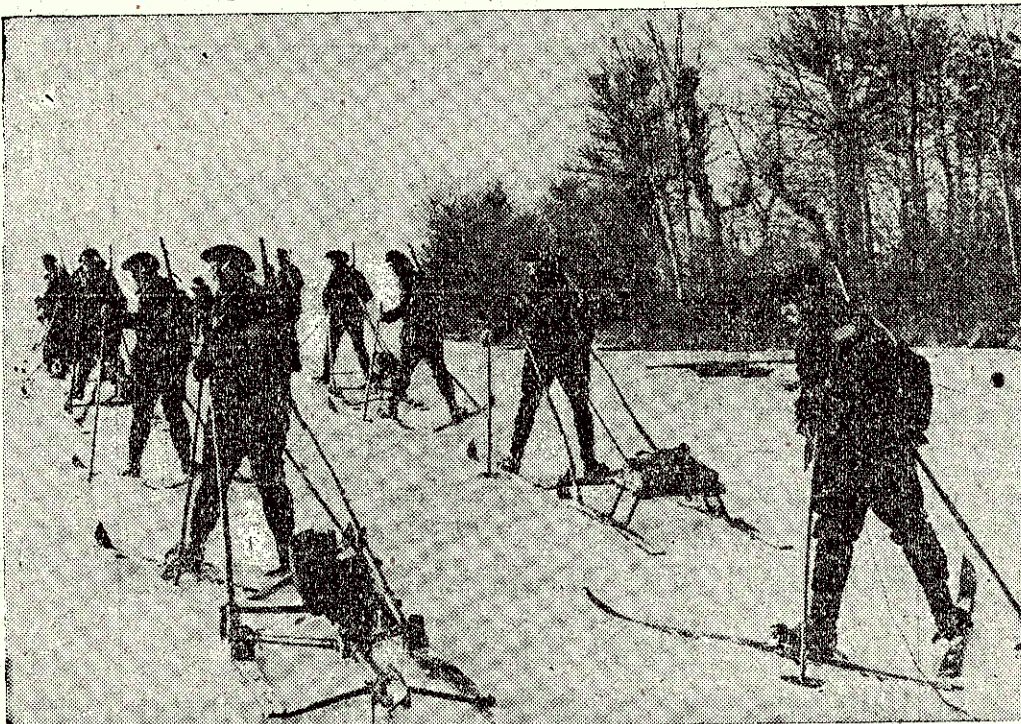
France has two fascist nations on her border line; beyond the Rhine, Germany; beyond the Alps, Italy. French troops (above) are going through rigid practice maneuvers on the Italian border. Recent conversations between Hitler and Mussolini are paving the way toward a fascist alliance for the re-division of Europe and invasion of the Soviet Ukraine. Vigilance on all borders is necessary for the People's Government of France.

The Communist Party is now the largest by far in all this key region.