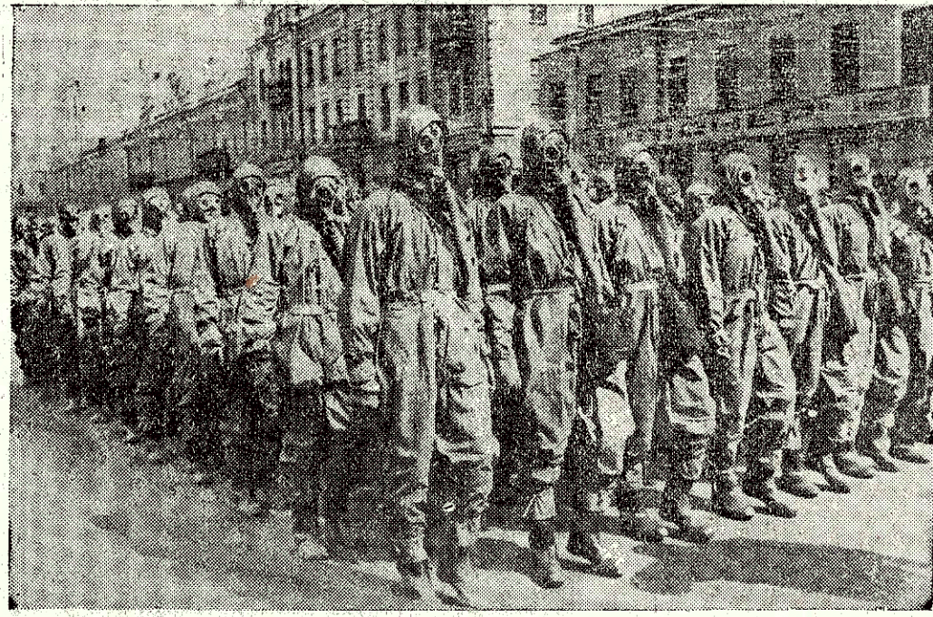
Menaced by war threats on two borders, the Soviet Union is drilling its youth in the use of gas protection devices. Clad in masks and anti-mustard gas suits, these Soviet citizens in Kiev paraded through the streets as a part of the opening ceremonies for the 9th Congress of the Young Communist League of the Soviet Union.